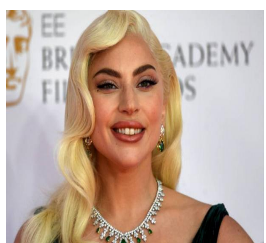
3. So was Lady Gaga