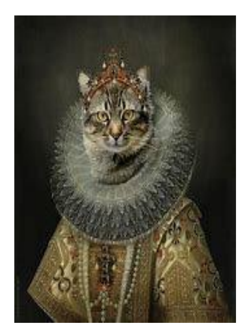
Aristocracy and pop culture